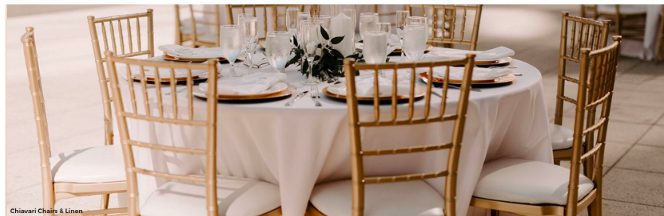
Chiavari Chairs & Linen