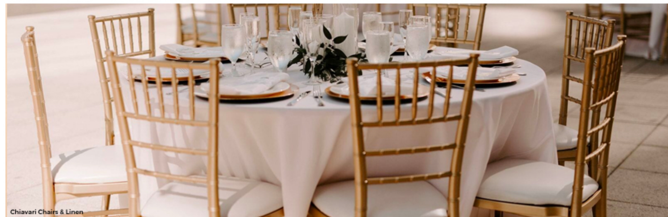
Chiavari Chairs & Linen