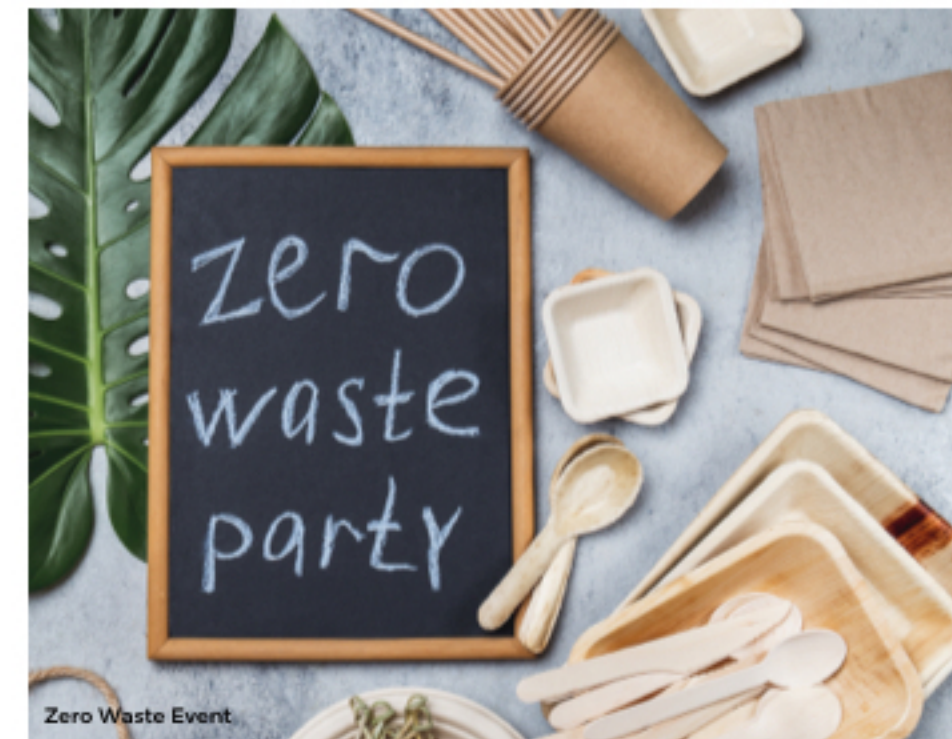
Zero Waste Event