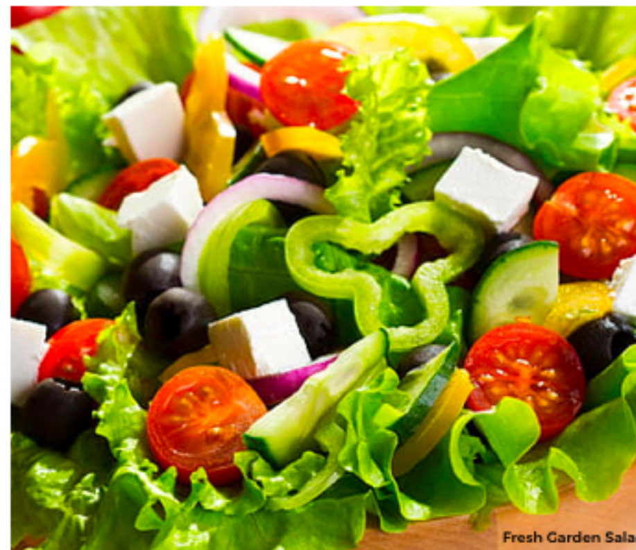
Fresh Garden Salad